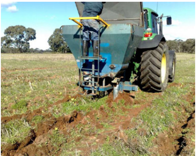
The subsoil manuring machine applying treatments in 2015.

Three representative soil types were examined physically and chemically down the profile by digging soil pits. Moisture monitoring devices were co-located at these sites adding value to the information received.